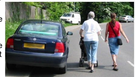
Inconsiderate pavement parking poses a real risk to pedestrians, who can be forced out into the road.

Parking on a pavement is sensible in some circumstances. E.g. parking wholly on a narrow road might stop other vehicles, particularly emergency vehicles, from getting through. Therefore on narrow roads it may be a good option to park partially on a pavement. However this is provided that a) there are no parking restrictions and b) you are not blocking a pedestrian, wheelchair user, service dog, or pram, from using the pavement. Dropped kerbs, giving access to or egress from the public pavement to the road should not be blocked either.