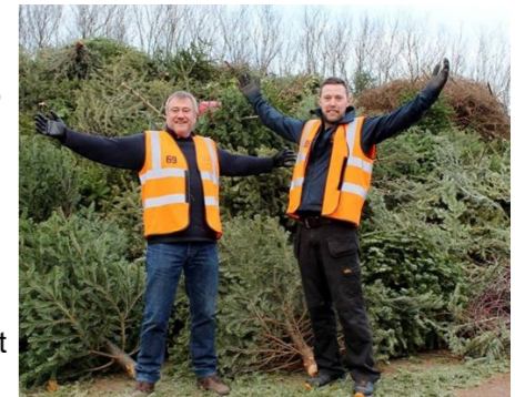
Tree-cycling with St Giles Hospice