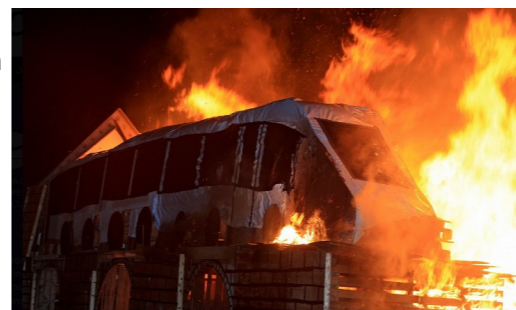
Villagers in Speen set fire to an effigy of HS2