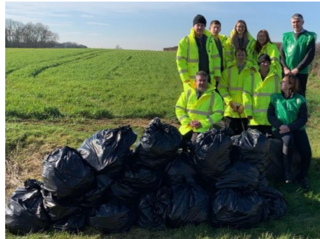
The team from MacDonalds and their collected litter