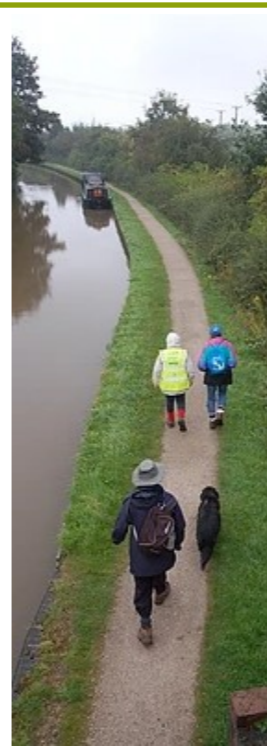
Walk this way!